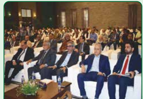
View of audience