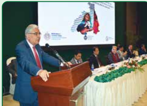
Federal Ombudsman expressing his views