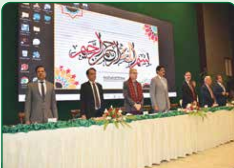
Standing in respect of the national anthem